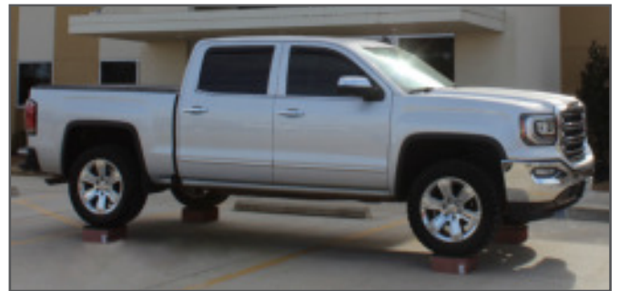
We took four pieces of our standard 6" thick Kuul Vitality media with DuraPro and let them fully support the weight of a 4000+ pound truck. The media suffered little to no damage.

Kuul Vitality evaporative media is produced with the highest quality virgin materials, with a unique design and production technique. It is the strongest and toughest media on the market and has been specifically designed with the poultry industry in mind. In ideal settings, this series of evaporative media can last much longer than competitor media. This saves you real money and time.